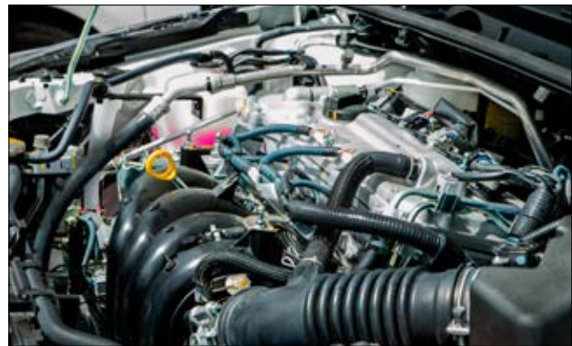
SA47-HT provides optimum protection against moisture in high temperature applications.