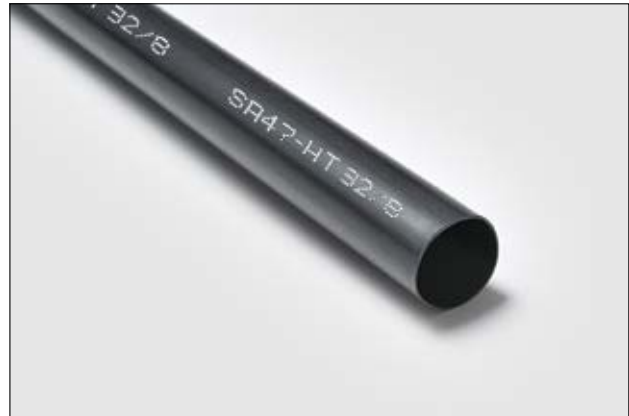
Heat shrink tubing SA47-HT for 150°C application.