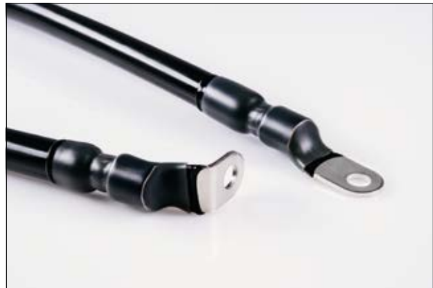
Heat shrink tubing SA47-LA for cable connection.