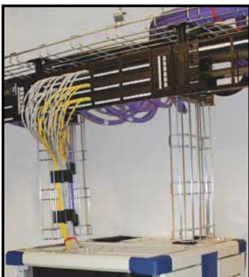
Out of Rack Connectivity Solution located above Active Cabinet

All three options include 2 Zero U RapidNet cassette locations within the 600mm width ie: a total capacity of 3½U.