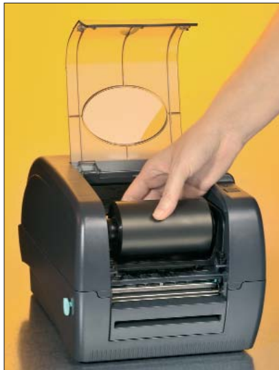
Easy ribbon loading.

The TT420+ is virtually limitless when it comes to suitable applications. It can be used for identification of goods in the logistics area and marking of cables in the electrical industry.