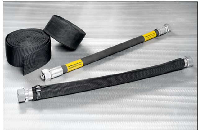
Helagaine HEGWS burst protection sleeving made of polyamide 6 offers excellent abrasion protection.